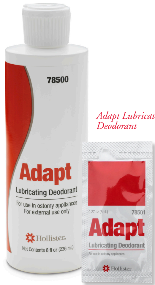
Adapt Lubricating Deodorant

“Part of your confidence with an ostomy comes from experience.”