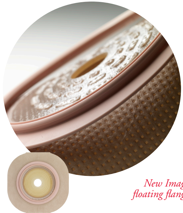
New Image floating flange

A: It's a good idea to select a pouching system that has a low profile. If you have a colostomy or ileostomy, gas can contribute to the profile so a filtered pouch may help. A filter continuously vents the gas and deodorizes it as it escapes the pouch. A mini-pouch or closed pouch may be an option for short periods of time when you are active like during an exercise class. Also, if you use tape to support your skin barrier, try using beige tape instead of white tape. It makes the border more discrete under lightweight clothing.