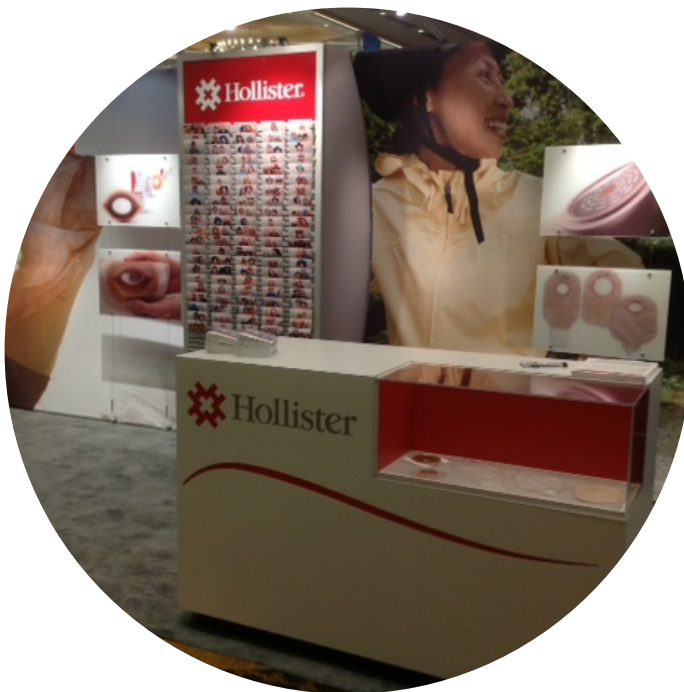
The Hollister booth at the UOAA Conference