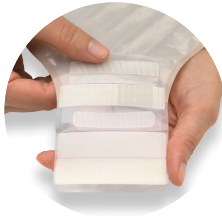
Lock 'n Roll microseal closure

A: Yes, integrated closures such as the Lock 'n Roll microseal closure are less noticeable. This closure is much more comfortable, secure, and provides a lower profile when compared to clamps.